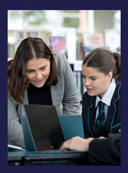
Literacy and Numeracy Across the Curriculum

Learning is structured and sequenced. Teachers model processes, build background knowledge, provide guided practice, and offer timely feedback to close learning gaps and extend thinking.