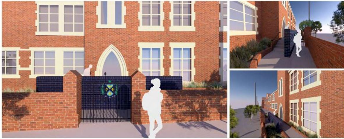
Corbett Wing, Westbury Street Reception Entrance Ramp

We are also delighted to announce the fitting of artificial turf in the courtyard of the campus to add a softer and more contemporary feel, and the addition of new picnic settings courtesy of the P & F.