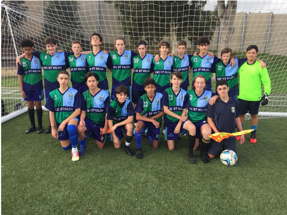
ACC Intermediate Soccer 2021 Premiers